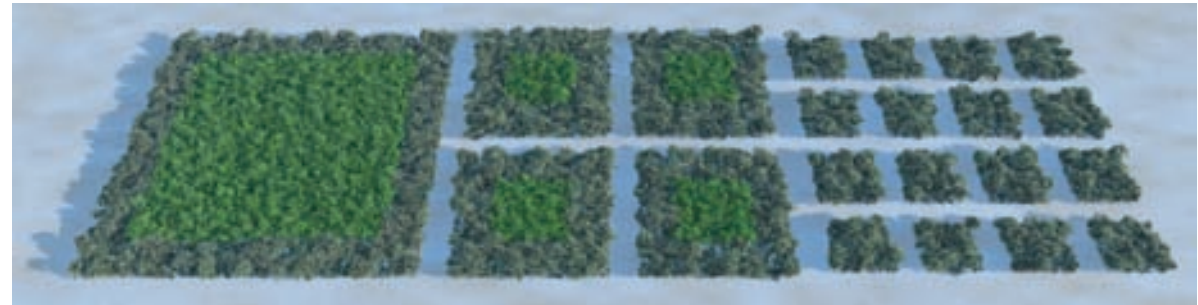
Protected interior environment (brighter green), progressing to those that essentially become all edge environment and no interior.